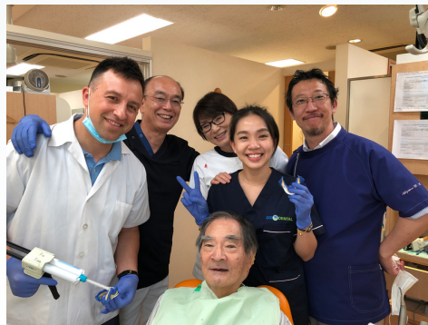
Figure 6: Successful retrieval of suction effective mandibular functional impression for a challenging case.